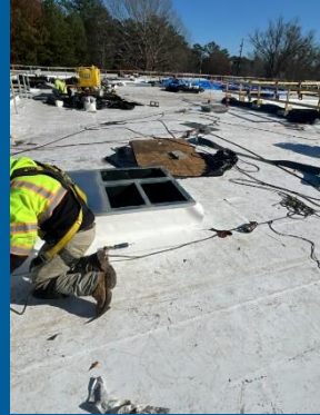
Roofing Activities ongoing New Controls wire being pulled